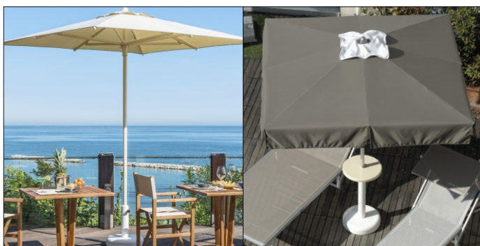
Full height pole h. 250/300